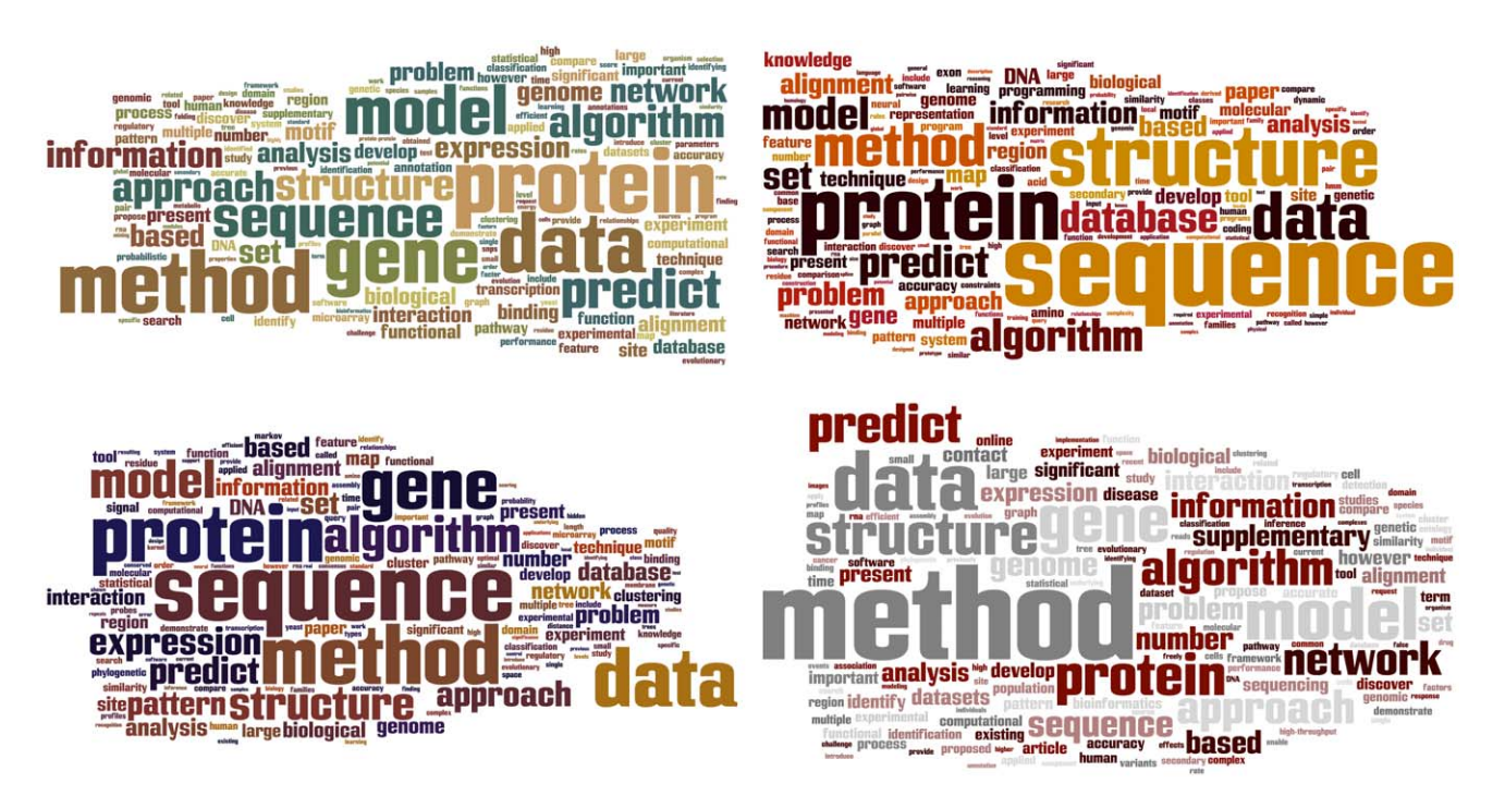
Figure 2. Proceedings titles and abstracts. Which word cloud reflects each five-year time period of ISMB? Each word cloud represents five contiguous years of conference titles and abstracts: 1993–1997, 1998–2002, 2003–2007, 2008–2012. The order of the clouds has been scrambled and can be found in the Acknowledgments. H/t, Jude Shavlik. doi:10.1371/journal.pcbi.1002679.g002

detail, and so massive in scale, that the computational challenges are just vast and out-of-this-world complex.